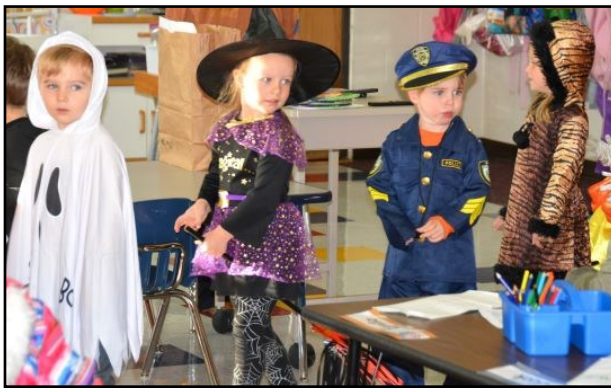
Preschool parades through the JK-7th parade classrooms

Enjoy the wonders of your children this weekend.