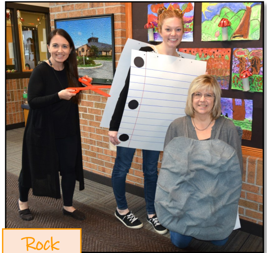
Rock Paper Scissors