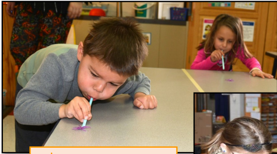
Halloween Parties, Games and Crafts