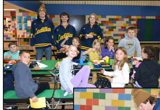
Some of the CAPS Hockey players visit the kids during lunch time.

Hats ~ Gloves ~ Mittens ~ Coats ~ Snow pants ~ Boots